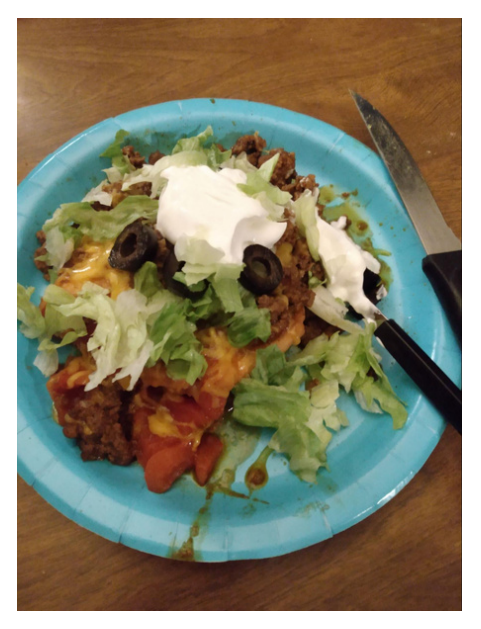
Autumn's Indian Tacos with frybread.

It turned out better than I expected. It was really easy to make and it came out really good with just four ingredients: flour, water, baking powder, and oil heated in a pan to fry it.