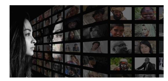
Bad Social Media

out and there that guy was in my bedroom without any permission. I texted someone and told them to get to my house right away. This guy kept cornering me and making me very uncomfortable. I told him to leave and luckily, he did. Someone got there and we rushed to the police station. Not only do we have to be careful with who we are talking to on social media, but we also have to be careful and aware of who others around us are talking to on social media. Ever since that day, I've been VERY cautious about who I talk to, who I hang out with, and so on.