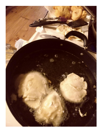
Autumn's Tumahsis or frybread.

I'm Native American and I'm researching my own culture and different kinds of bread that are made in different cultures. I've never made my own bread before. My mother and I have been wanting to learn how to make our bread from our culture which is called Tumahsis or frybread.