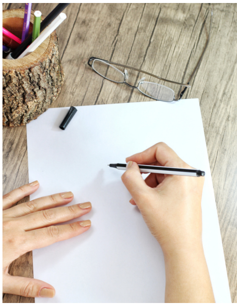
Writing a Letter

*please note that names have been changed for confidentiality*