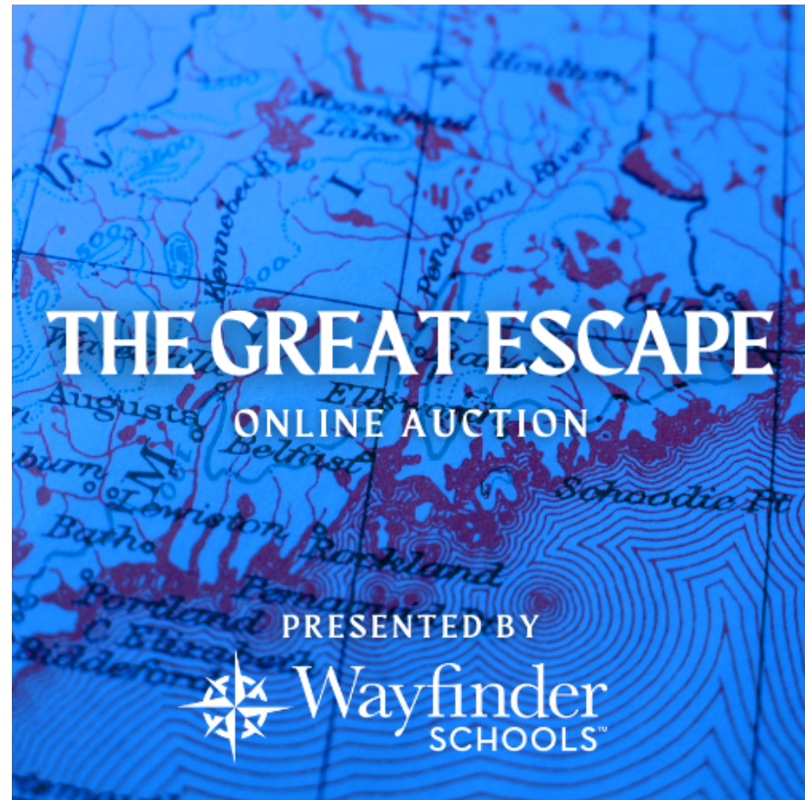
4th Annual Great Escape Auction