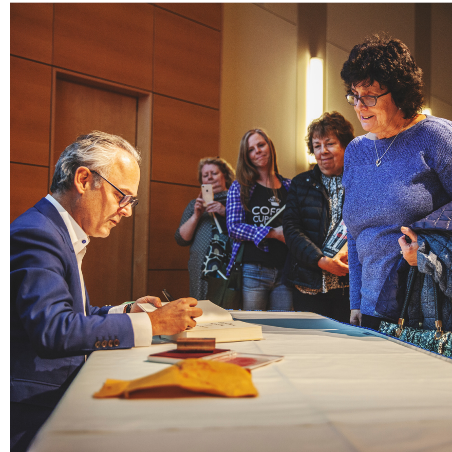
Wayfinder Schools' Author Event