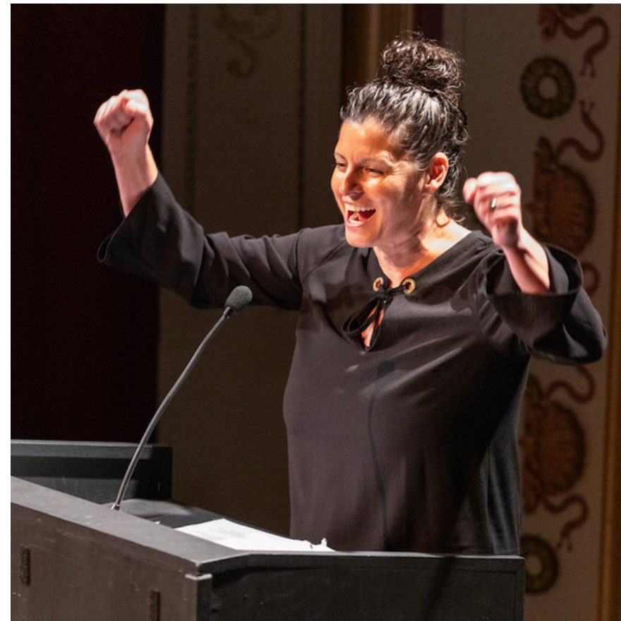
4th Annual Finding Our Way, Moth-Style Storytelling